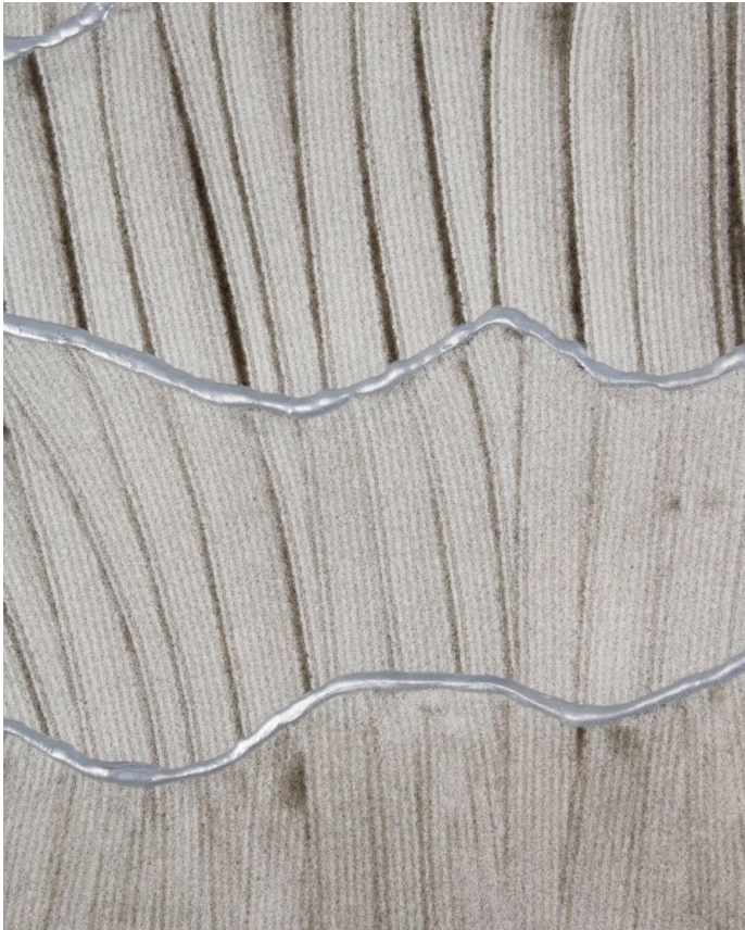
Closeup Detail View

With its monochromatic neutral palette and repeating patterns, “Sierras #2” creates a sense of expansiveness. This work is made from paper, which was painted with a loose organic strié pattern. The painted paper was torn into smaller pieces, rearranged, and then collaged onto a wood panel. Beads of metallic silver emphasize the irregular edges of the torn paper and create pathways through the piece. High-gloss resin is the finishing touch, augmenting the work by creating a heightened sense of dimensionality and vibrance.