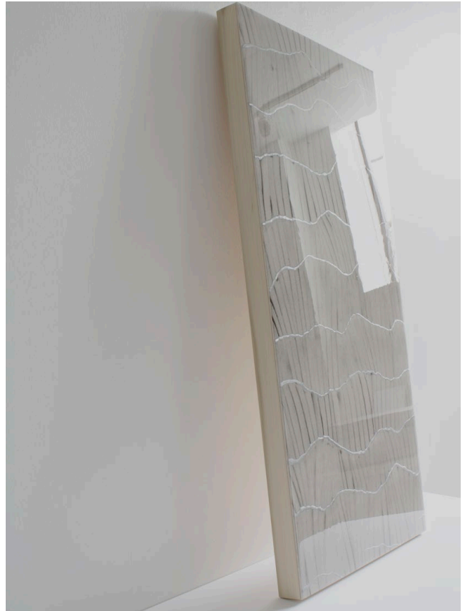
Side View showing glossy finish