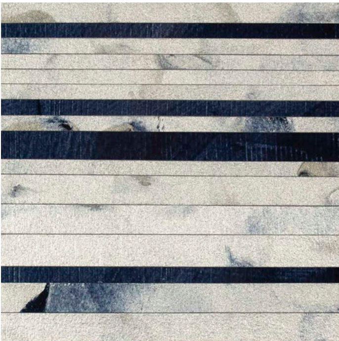
Closeup Detail View

Many of my pieces are finished with high-gloss resin, a step that requires precision and patience to produce the final effect. The resin further augments the work by creating a heightened sense of dimensionality and vibrance while simultaneously highlighting the interplay of the painted pattern and the slick, structured finish.