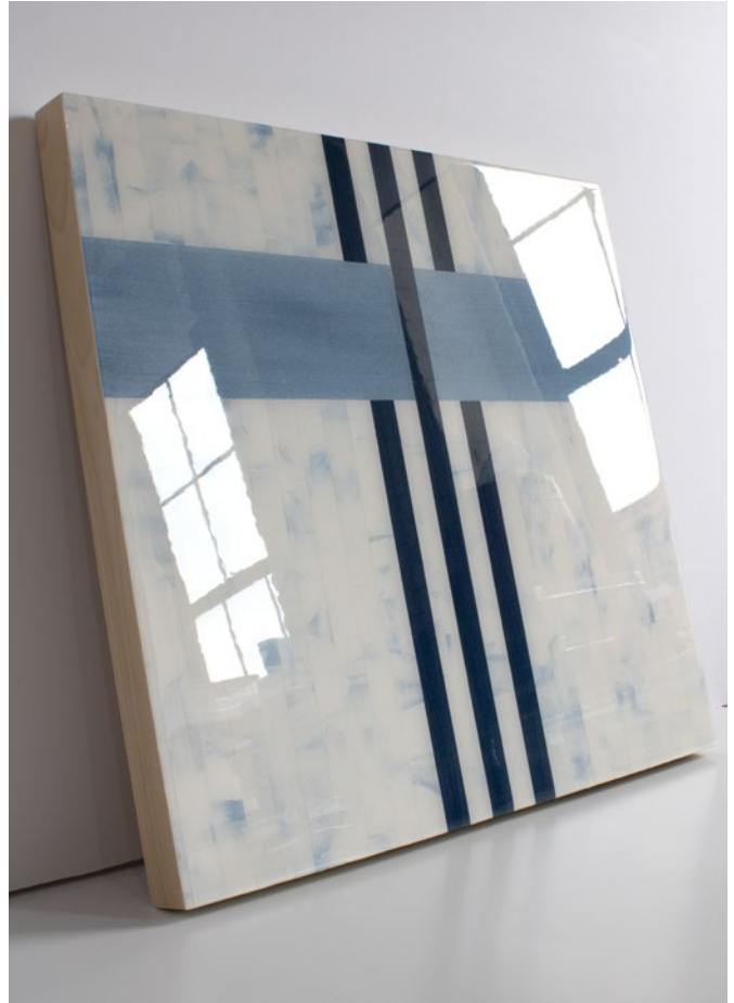
Side View showing high-gloss resin finish